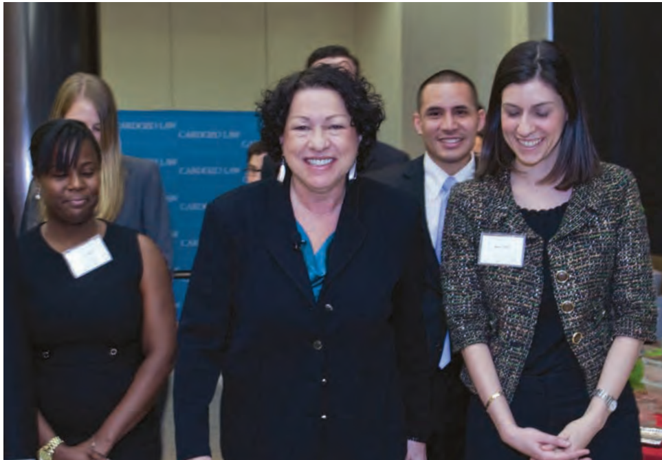
Supreme Court Justice Sonia Sotomayor participated in a conversation with students at the school.

Students with a keen interest in the Constitution find inspiration in the many events hosted by this center, including speaking engagements and conferences. Recent convenings have addressed hate speech and the culture wars, civil liberties in the age of terrorism and taxing the church.